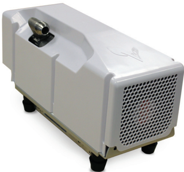
HARVEST RIGHT 7 CFM VACUUM PUMP